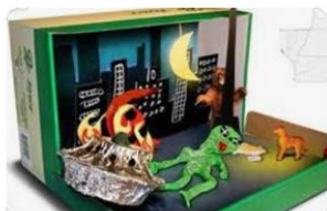
Story in a box